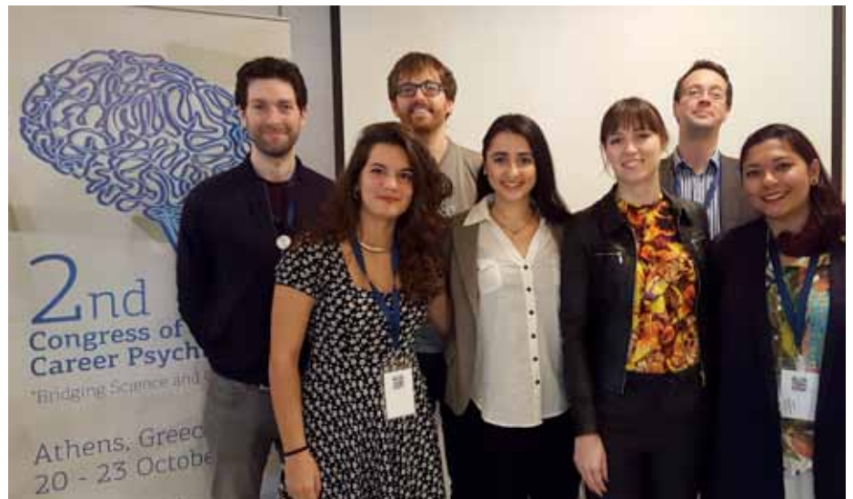
2nd World Congress of Early Career Psychiatrists in Athens, Greece, October 2016.

As part of our commitment to trainee lead research, we have now officially launched the EFPT Porto Research Award. Applications are now open for trainee lead projects working in WHO designated Europe region countries. An award will be made to the inaugural winner to recognise their success and to assist them in furthering the aims of